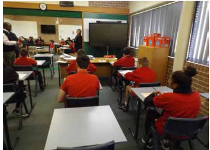
ABOVE: Year 7 students sitting NAPLAN exams

NAPLAN results have been mailed home to parents and we welcome any questions about the results reported. There has been a lot in the media about the results and the inconsistencies between the online version compared to the traditional pen and paper version. There has been discussion about the accuracy of the results and we certainly have looked carefully at the results in our own analysis. The Learning and Support Team at our school independently test all students to ascertain literacy and numeracy levels which they can then compare to external exams such as NAPLAN. We must also remember NAPLAN is a snapshot of student performance and could be impacted by variables on the day such as health or