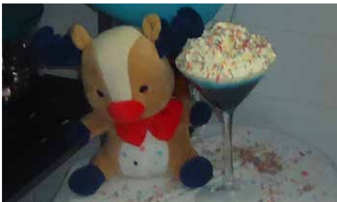
There was a wonderful array of colours in the drinks and a lot of thought and flair in the props used.